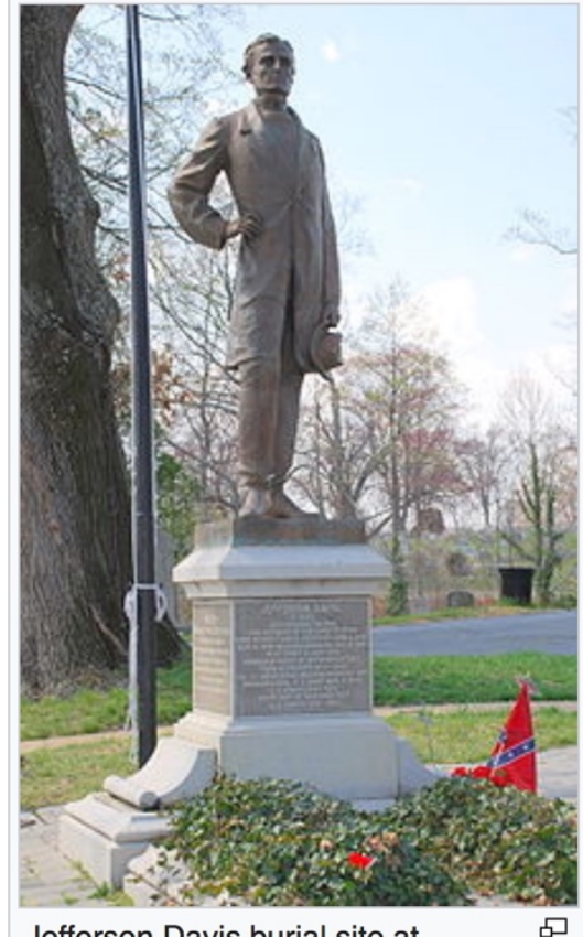
Jefferson Davis burial site at Hollywood Cemetery in Richmond, Virginia, beneath a life-sized statue

Souce:http://www.encyclopedia.com/doc/1G1-141167602.html